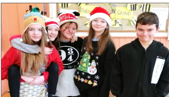
(Printed with permission)

Thank you to all those who supported us at our coffee morning. We raised £250 which will be divided between the Busia project and the Tweens fund.