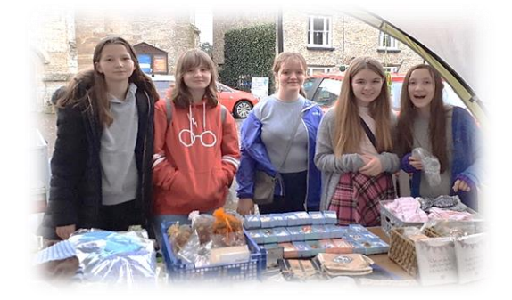
The Tweens helping on the Bronze stall (printed with permission)

A big Thank You to everyone for supporting the One World Week Sale last week in the Square. The weather was fine and dry and a total of £1400.00 was raised for the various charities.