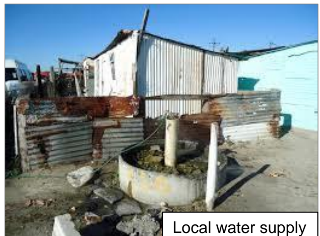
Local water supply